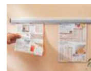
Wall Display Rail