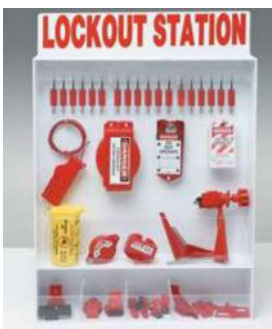
Adjustable Lockout Stations - Extra-large Lockout Station