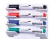
Magnetic Marker Holder (Magnetic Metallic Adhesive Tape is necessary to place the marker holder)