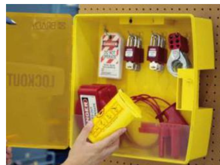
Portable Lockout Station