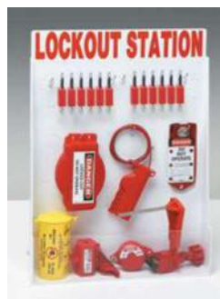
Adjustable Lockout Stations - Large Lockout Station