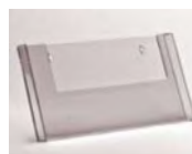
Wall Document Holder