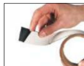
Magnetic Metallic Adhesive Tape