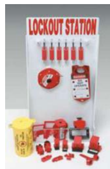
Adjustable Lockout Stations - Small Lockout Station