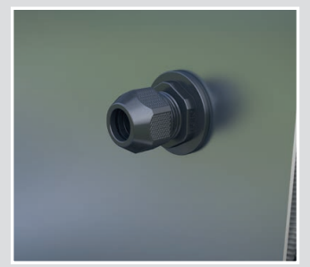
Quick and easy installation from Pull the cable through and tighten the outside