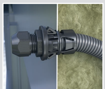
Click the Syntec® facade feedthrough into place in the