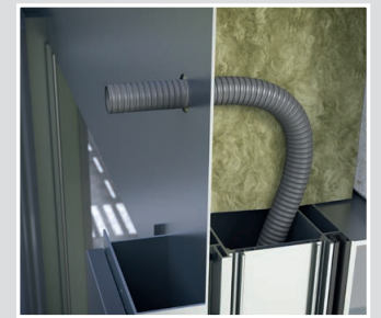
Guide the protective conduit through the facade