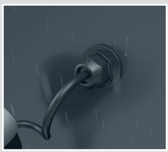
The innovative Syntec® facade Free of thermal bridges and well feedthrough is well able to with- sealed (IP 66) stand the effects of rain and wind