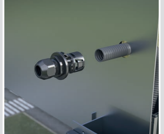
Click the conduit into the Syntec® facade feedthrough