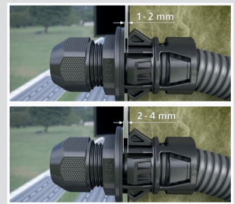
Sheet thickness 1 - 2 mm (2 sealing), Sheet thickness 2 - 4 mm (1 sealing)