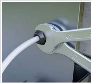
the compression nut with a spanner